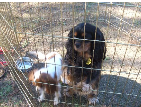
Betty and Sammie are trying to figure out how to escape from the hoosgow to join in the fun at the puppy picnic - Dixie Westmoreland