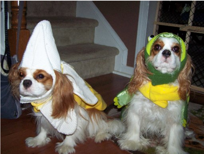
Finn (Karvale Brookhaven Finn) and Skye (Brookhaven Dream Time) are NOT happy that they were paraded around and humiliated on Halloween as a banana and a turtle.