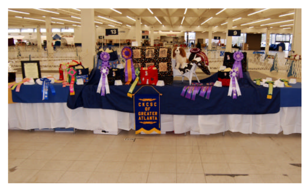
CKCSCGA 2009 Trophy Table