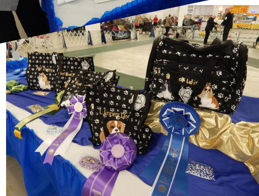
BEST BRED BY EXHIBITOR