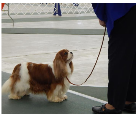
RESERVE WINNERS DOG