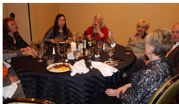
MORE PICTURES NEXT MONTH